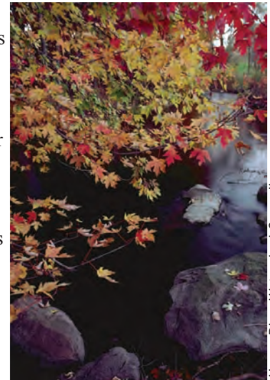
Huron River Watershed Council

in pollutant processing capacity between forested and non-forested segments. Stroud found that forested streams were far more efficient at removing key pollutants in the water than non-forested streams. In the case of nitrogen pollution, forested stream segments removed 200 to 800% more than non-forested segments—a finding that should prove vital to regional water quality improvement programs.